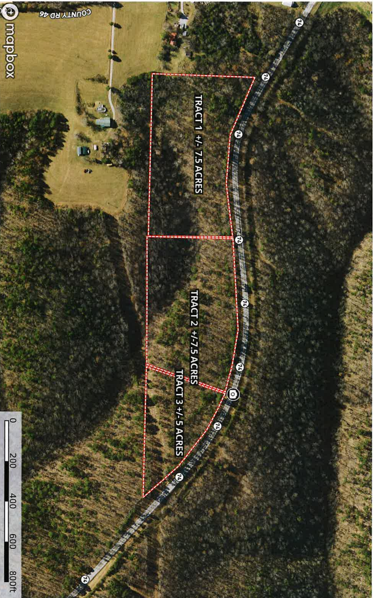
Photo Point Boundary